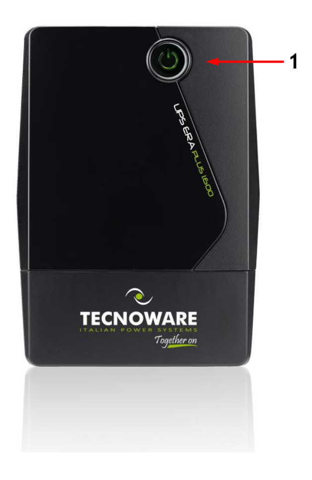
Figure 1 - Front panel