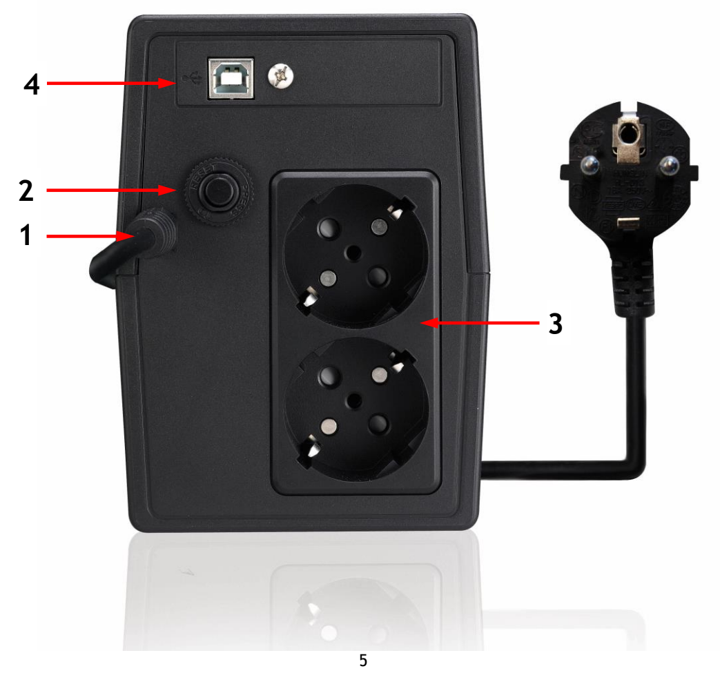
Figure 2 - Rear Side